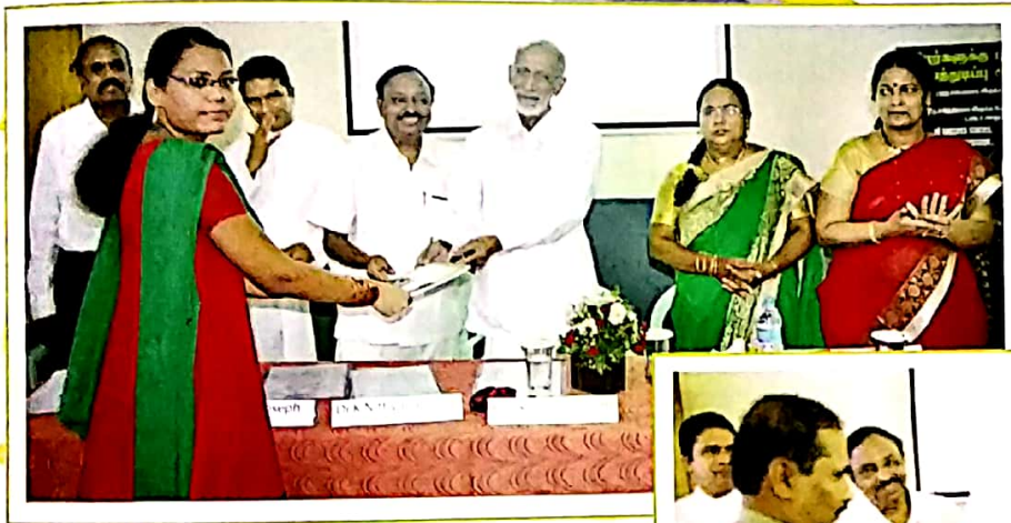
A student receiving Gandhi Study Centre certificate