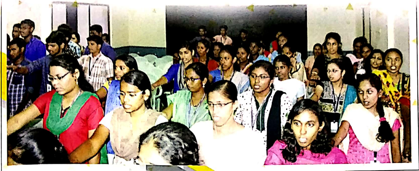
The members taking the pledge of the Reading Club